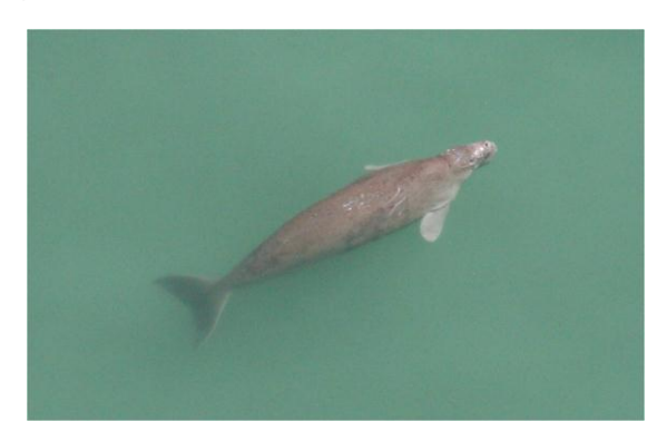
Fig. 1. A dugong in Thailand

Peaceful co-existence in coastal areas between the human activities such as coastal fisheries and conservation of endangered animals such as dugongs (Dugong dugon) is an important matter to be solved for sustainable development of marine resources. Dugongs are herbivorous marine mammal that range throughout tropical to subtropical region (Marsh et al., 2002). They are listed as vulnerable to extinction in the IUCN Red List and the concerns for their extinction are rising day by day.