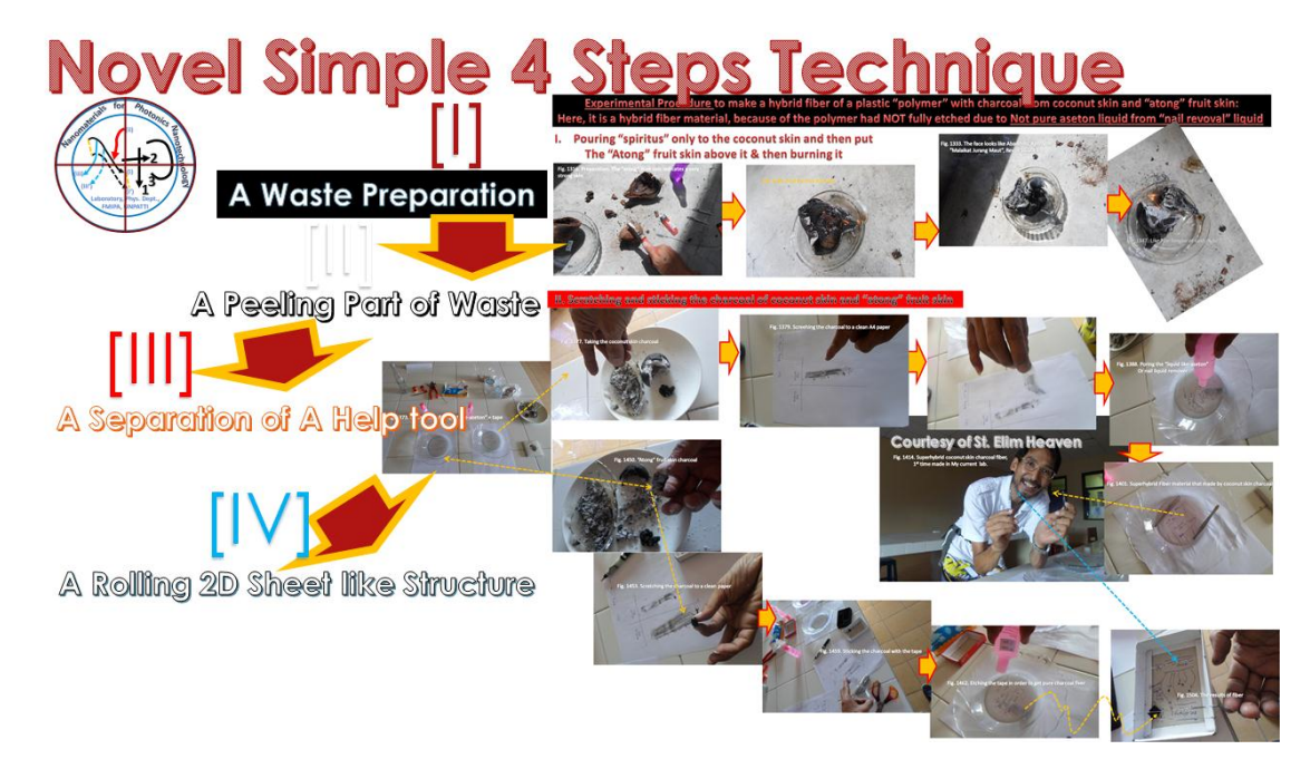
Figure 2. Our 4 steps simple technique to manipulate a waste marine sample into a treasure novel structure with some attractive various properties.

In this picture, the 1<sup>st</sup> example of our 1<sup>st</sup> experiment at our Lab. N4PN that we used it to make a novel fiber from an outer dried coconut skin found inside Pattimura University (UNPATTI) and was firstly presented at an annual forestry department seminar of UNPATTI on 15<sup>th</sup> December 2014 in Elizabeth hotel, Ambon.