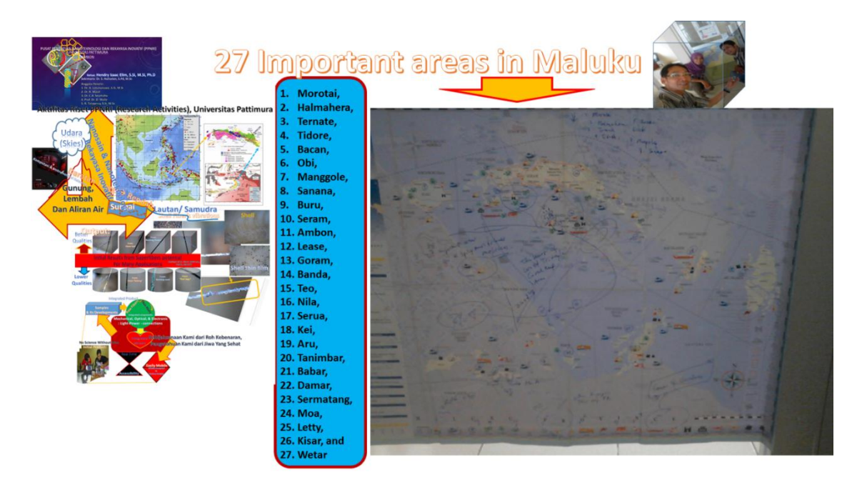
Figure 1. Mapping the wise works on how to employ marine wastes in thousand spicy islands of Maluku province, Indonesia.

In this paper, we provide our preliminary works on creating simple novel fibers from some marine wastes materials such as some rejected ocean materials from beach stones, shells and coral reefs and even the skins of sea foods animals with their new structures and new behaviors. Based on our initial findings, these kinds of fibers have elasticity behavior like a rubber that can be elongated as long as 7 times longer. While on the skin of a type of shell that we found in a beach of Murnaten village located in the West Seram island, we observed that such novel fiber is strong due to a bound of many small fibers that are tied together in contact one another to be a micro fiber which is just like you gather many small elastic nanofibers together to be a powerful nano-stick.