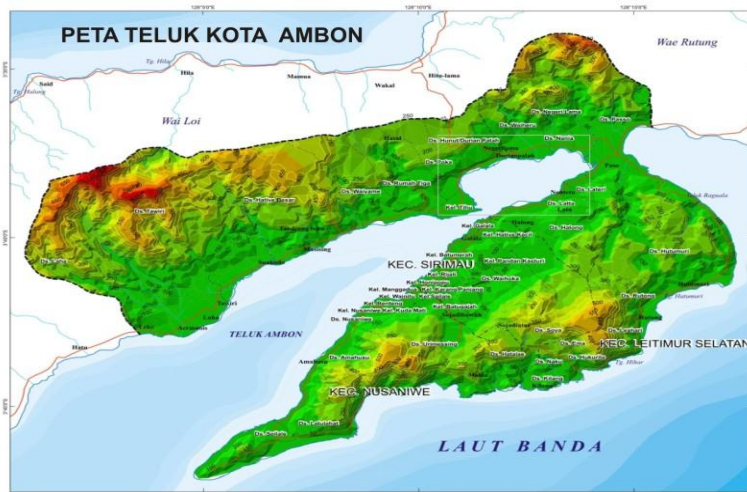
Figure 1. Map of Ambon City and research sites

Sampling was conducted on July 4, 2011, about noon under cloudy weather in Hative waters surrounded by population settlement, estuaries, navy complex, harbour, oil depot of Pertamina, and sago plantation. Callispongia sp. ca 50 grams were taken under physical conditions and content analysis as seen in Table-1 below.