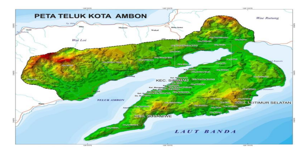
Figure 1. Location of Sponge Sample at Ambon Bay.